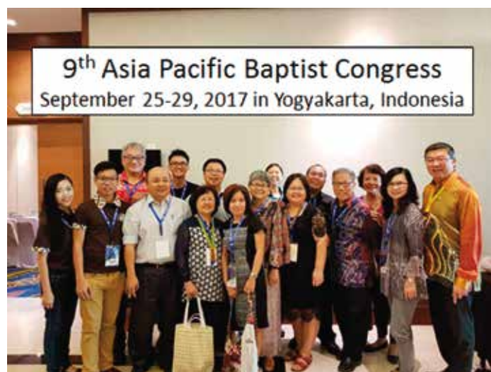
Our Malaysian delegates. 我们马来西亚的代表团。

第九届亚洲浸信大会于2017年9月25日在日惹隆重举行，来自22个国家超过1100参与者济济一堂，为每五年举行一次的亚洲大会，共襄盛举。透过浸信大会，不同国家的代表团借着这个难得宝贵的机会彼此认识，建立友谊和配搭关系。在这四天的大会中，主办当局安排了许多不同的工作坊，讲员都是著名杰出的领袖，神学家和牧师。期间也有热情洋溢的敬拜，才华横溢的表演者呈献文化音乐会，为大会带来充满活力鼓舞的气氛。第十届亚洲浸信大会将会在2022年在韩国首尔举行。