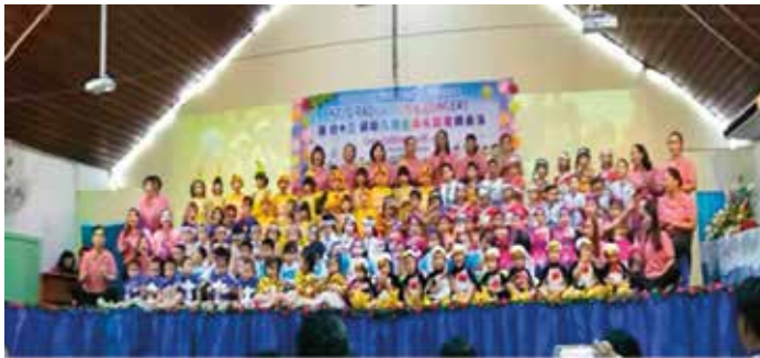
Taska Baptis Tawau Graduation Concert

TBC has English, Mandarin and Malay congregations with a total attendance of 300 weekly. As for ministries, TBC has