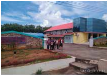
Xi An Chapel

Our next stop was Xin An Chapel , a church plant by Tawau Baptist Church. Way back in 1997, this church originally