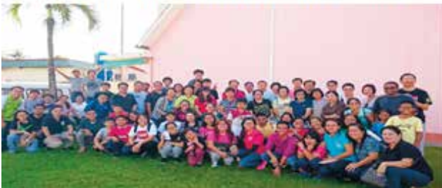
The Food Basket Team Blessing under-privileged families with food baskets

As a church that serves its community, their mission is to lead people to become disciples of Christ. The church has various out reaches to the communities in Sandakan, such as their Blessed Campaign, Blood donation, giving food baskets to poor families, etc. On Sundays, there is a