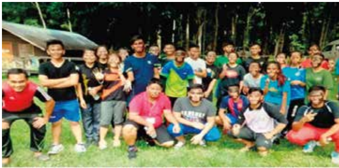
SYM (School of Youth Ministry) - Sabah on 14 Jan - 05 Feb 2017 at Madai Baptist Church, Kunak, Tawau.