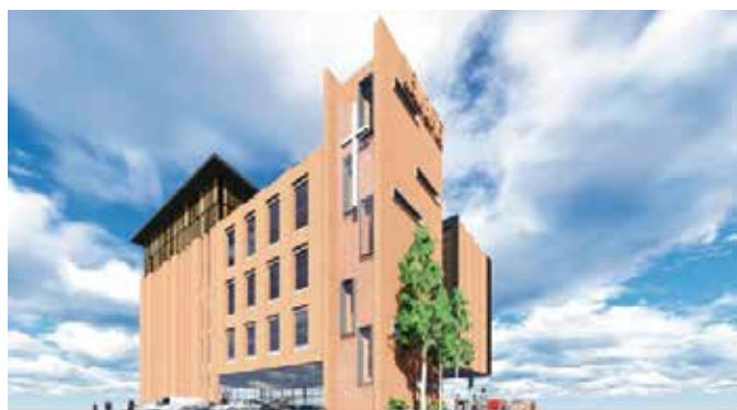
HOW TO CONTRIBUTE TOWARDS 如何奉献 THE WISMA BAPTIST PROJECT

Issue cheque payable to 支票抬头请写: Malaysia Baptist Convention Account 2