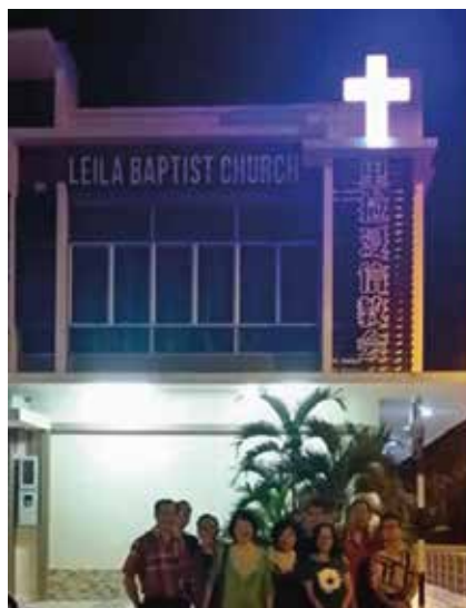
Leila Baptist Church's new building, a 2-storey shop lot, located at Bandar Utama, Sandakan 6 th Mile.

The church has four cell groups that meet twice a month on Fridays. Of the two meetings, one is devoted to visitation and the other, for training of members. Regular meetings include Family Group Fellowship, Youth Fellowship, weekly Prayer, Sunday school for children, etc. LBC's most urgent prayer request is to find a suitable pastor to shepherd the growing church.