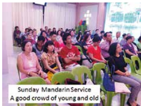
Sunday Mandarin Service A good crowd of young and old

Leila Baptist Church (LBC) was first formed in Bandar Leila; hence the origin of its name. An outreach of SBC, LBC