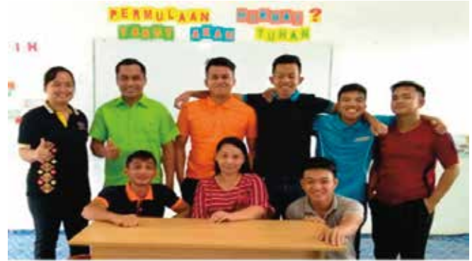
Current Students of PLAB PLAB 的在籍学生