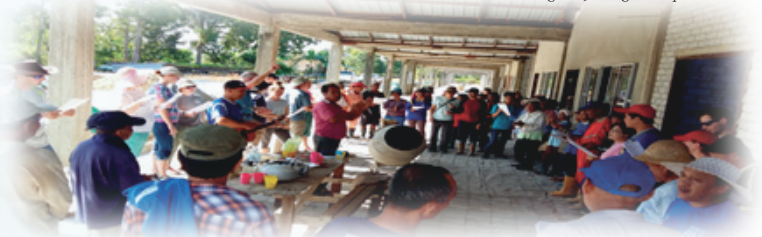
Locals at Tawang Ulu joining worship service

在Tawang Ulu, 共有40个家庭居住在一个已经长达50年非常陈旧的长屋里。因着有鳄鱼侵袭的因素，长屋重建计划一直被耽搁长达8年。为了进行长屋重建计划，他们就开始与教会合作。教会的义工去帮助他们铺泥灰，就在这个过程中与他们建立了关系继而分享福音。接着彼此所建立的信任和关系，他们开始和义工们一起参与崇拜，他们的孩子有很多来参加儿童活动。接着，他们也要求我们为他们的需要祷告。透过布道晚会，我们带领47人归向主。