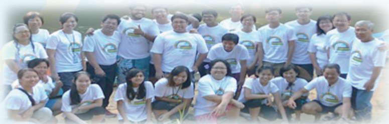
Longhouse Children Camp Volunteer Teachers

The homes for the RH NuNong people were rebuilt after they were lost to a fire on 24/10/2015. 49 families were affected. Through the very real and immediate response of the physical needs of this community, the church gained its trust. 52 locals from this community came to know the Lord.