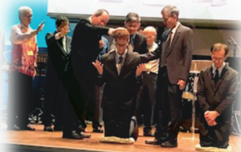
Ordination Service on Celebration Night

由乔治市浸信教会带领敬拜赞美，为这一年来的合一和同工配搭而欢庆一起献上美好的敬拜赞美。我们为着乔治市浸信教会提供大会使用他们新礼堂表达万分感谢。当晚的节目精彩丰富，包括来自Sg Ara 浸信教会充满活力又创意的节目呈献，TCWC呈献印度舞蹈表演，EPCC呈献砂拉越和沙巴舞蹈，以及马浸神学生们的诗班呈献。除此之外，当晚我们也见证了个别为Hillside浸信教会和YWAM举行的按牧礼和差遣礼。