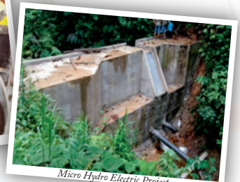
Micro Hydro Electric Project