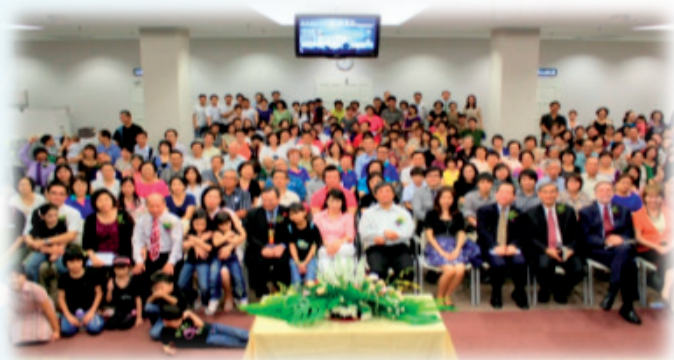
Church Dedication 12/12/2012

我们也计划在2018年1月份举办义卖会，并邀请槟城北部的众教会一起来参与兴建浸信大厦的筹款活动。我们相信只要大家同心协力就可以共同完成这项计划！愿神赐福我们所做的一切！