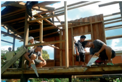
Gotong Royong to build the Pastor's house in Kg Serudung Laut