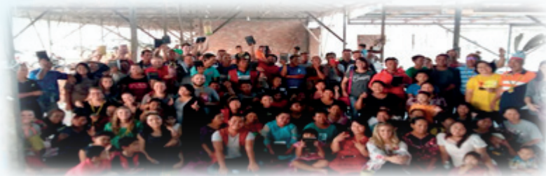
Discipleship class for Longhouse Residents at Mukah